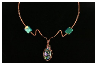
Samples of wire wrapped jewelry

Annette Kinslow, Wire-Wrapped Cabochons Workshops will begin immediately after her demo at the September 12th meeting (p.2) . Each workshop of 2 1/2 to 3 hrs is priced at $50, plus the cost of materials. Annette has said that kits will be available online from her website and typically run about $15. http://kinslowart.com